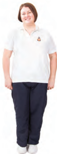
Officer Working Uniform