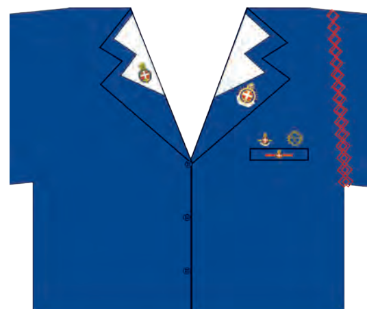
Officer Uniform with two other awards