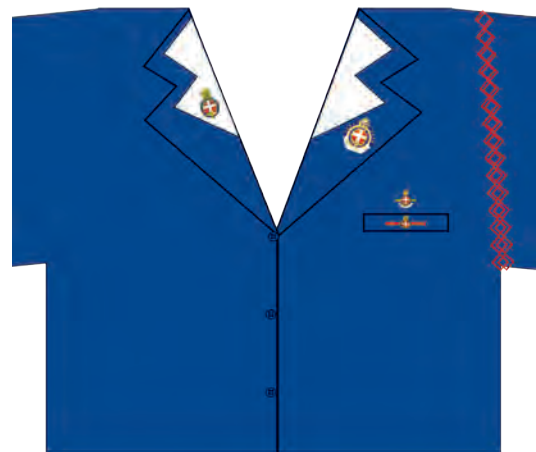
Officer Uniform with one other award