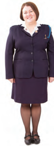
Officer Ceremonial Uniform